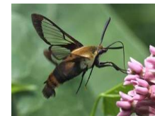
← Hummingbird Sphinx Moth

Your Newsletter is Available Electronically. To receive your newsletter electronically, let me know by sending a request to me at livelyroque@msn.com . Also, if you are receiving it electronically and change your e-mail address, please let me know.