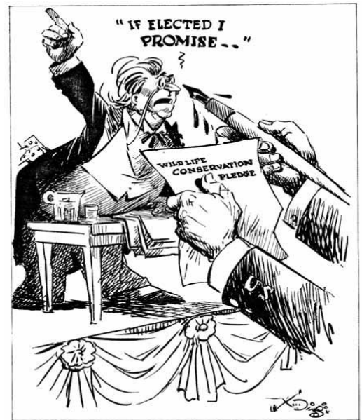
Don't say it—Sign it!

Browns Woods & 63 rd St clean-up April 14 th , 9 am to 11 am. You are cordially invited to participate in the annual clean-up, sponsored by DM Izaak Walton League, Huntmaster's Club and Polk County Conservation. Lunch will be provided by the Huntmaster's Club. (meet at Browns Woods Park entrance)