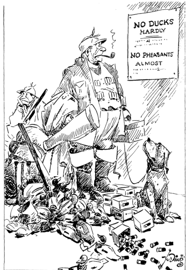
All dressed up and no place to go "All Dressed up and no place to go"