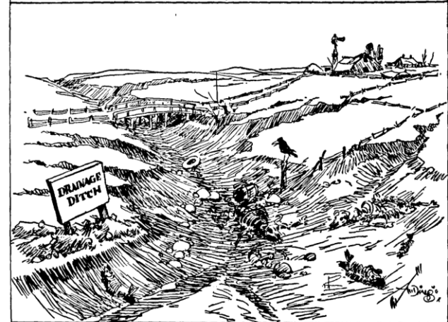
"How Man Improves on Nature"